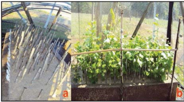
Figure 2. P. acerifolia cuttings. In sand bed on planting day (a); sprouted cuttings (119 days after planting) (b).

Figure 3, shows lower number of roots in cuttings planted at 40 cm depth compared to those buried at 20 cm depth.