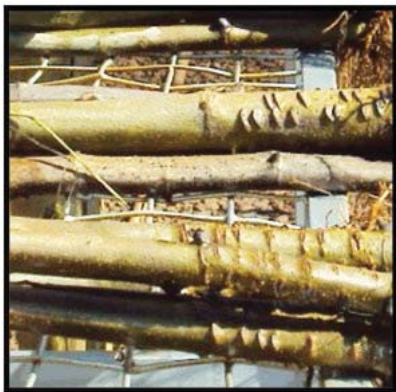
Figure 1. Injured P. acerifolia cuttings

To perform the injury, a knife with a 30-cm flat blade was used to cut at 10 cm from basal part of the cutting, causing small cuts in the skin (Figure 1).