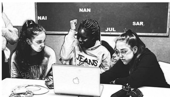
Figure 8 Shaking Fist from Top to Bottom