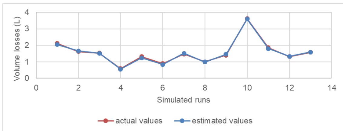
Fig. 1. Comparison chart between actual and predicted values for the neural network model (6-4-4-1).

2) Simulation. In order to verify the predictive capacity of the neural network, already trained and validated, the topology (6-4-4-1) was used to simulate 13 initial aging conditions. These values were determined as the average of the thirteen months of research for each variable analyzed, to ensure the interpolator character of the network. The quality of the model can be seen in Figure 1, where the actual values and those estimated by the neuronal model for the different initial conditions are shown. The average error in the estimate is 3.03%, the maximum error being 7.4%.